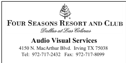
Exhibit Booth Info

Please complete the requested information below